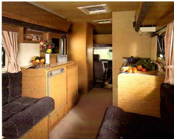
View through rear lounge.