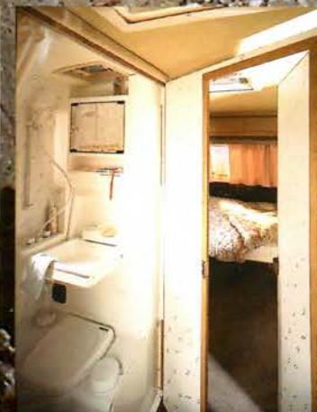
Extended shower/dressing area